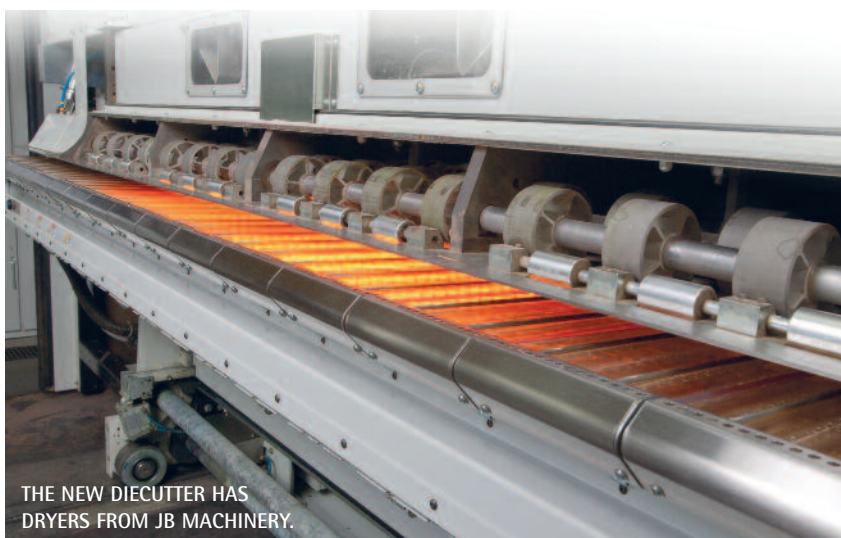
THE NEW DIECUTTER HAS DRYERS FROM JB MACHINERY.