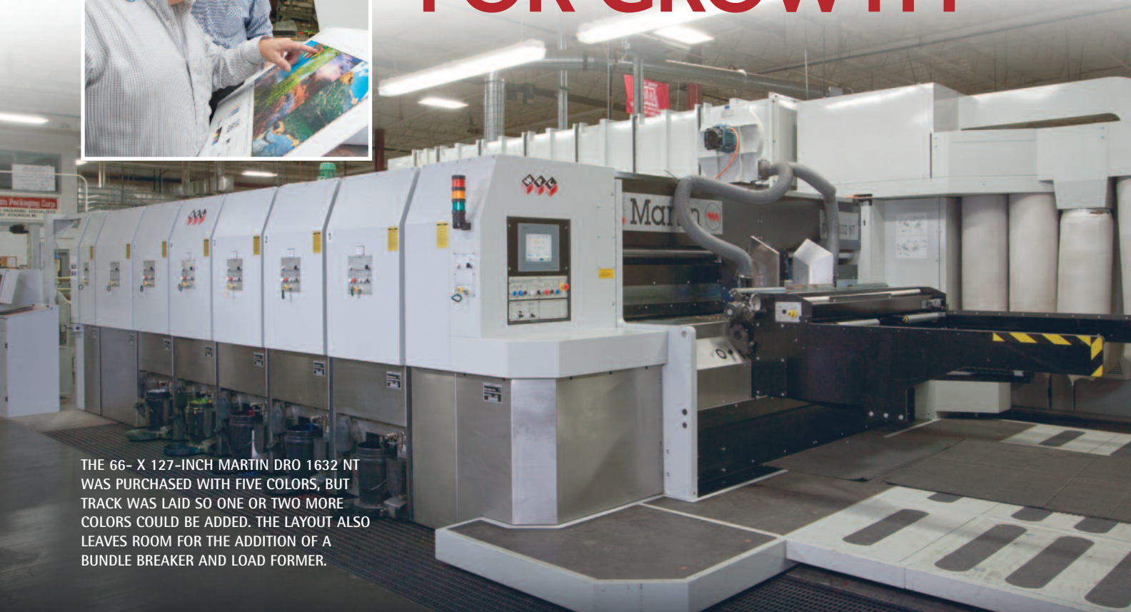
THE 66- X 127-INCH MARTIN DRO 1632 NT WAS PURCHASED WITH FIVE COLORS, BUT TRACK WAS LAID SO ONE OR TWO MORE COLORS COULD BE ADDED. THE LAYOUT ALSO LEAVES ROOM FOR THE ADDITION OF A BUNDLE BREAKER AND LOAD FORMER.