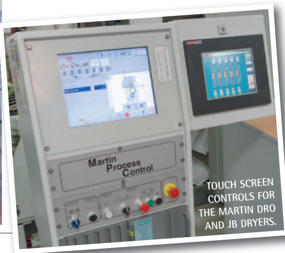
TOUCH SCREEN CONTROLS FOR THE MARTIN DRO AND JB DRYERS.

"Cross-training enables employees to go between machines with equal proficiency," he continues. "We have a five-man crew to run two flexos. They rotate in and out for breaks and that lets us keep running continuously. When we do the math, we find we're picking up a month of production at the end of the year even with just running one shift, five days a week. Because we never shut down we're