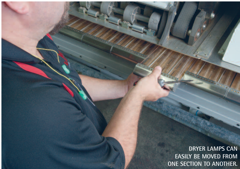
DRYER LAMPS CAN EASILY BE MOVED FROM ONE SECTION TO ANOTHER.

Supplier relationships and the support that comes from them is a key factor for Wisconsin Packaging. On the day of our interview a four-color process self-promotion piece was being run on the Martin DRO. As a demonstration of its printing capabilities the quality of this job was given a high priority. Providing onsite technical support for the run were